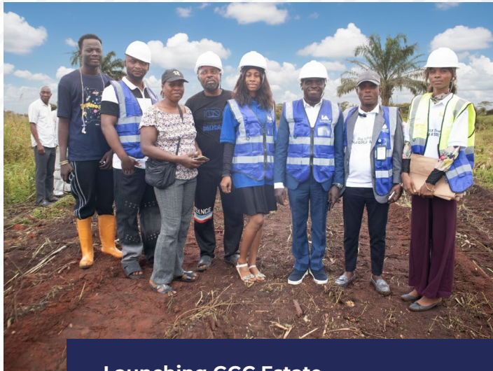
Launching GGC Estate