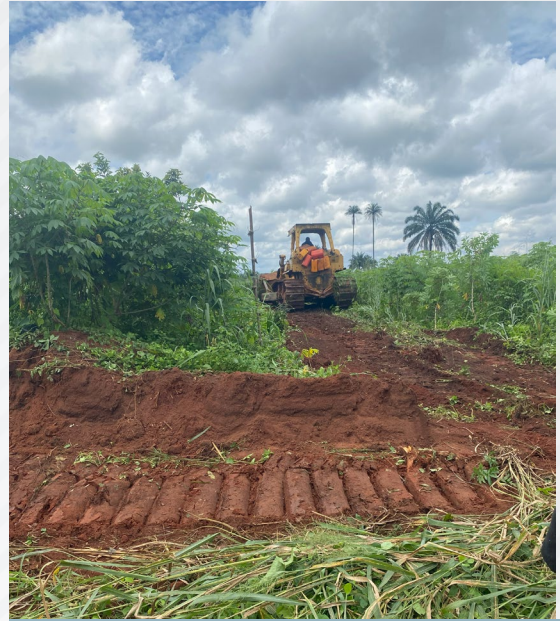
Road Mapping @ GGC Estate

' Real estate is an imperishable asset, it transcends generations'