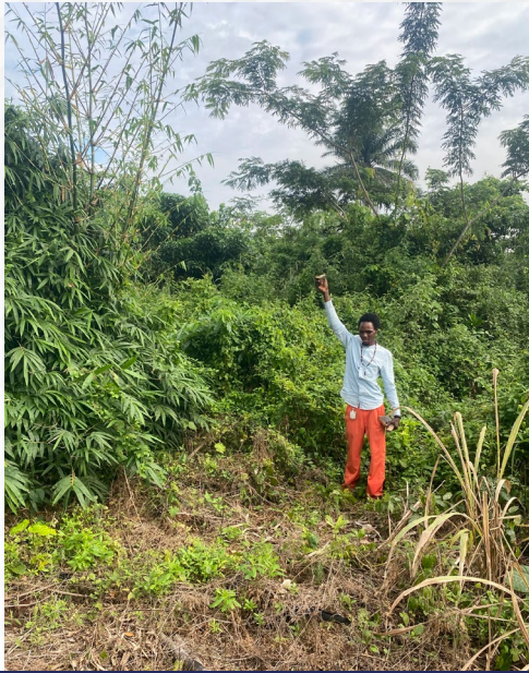
edoGIS verification @ GGC Estate